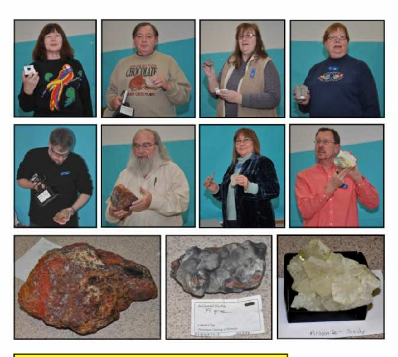
SHOW TABLE PARTICIPANTS